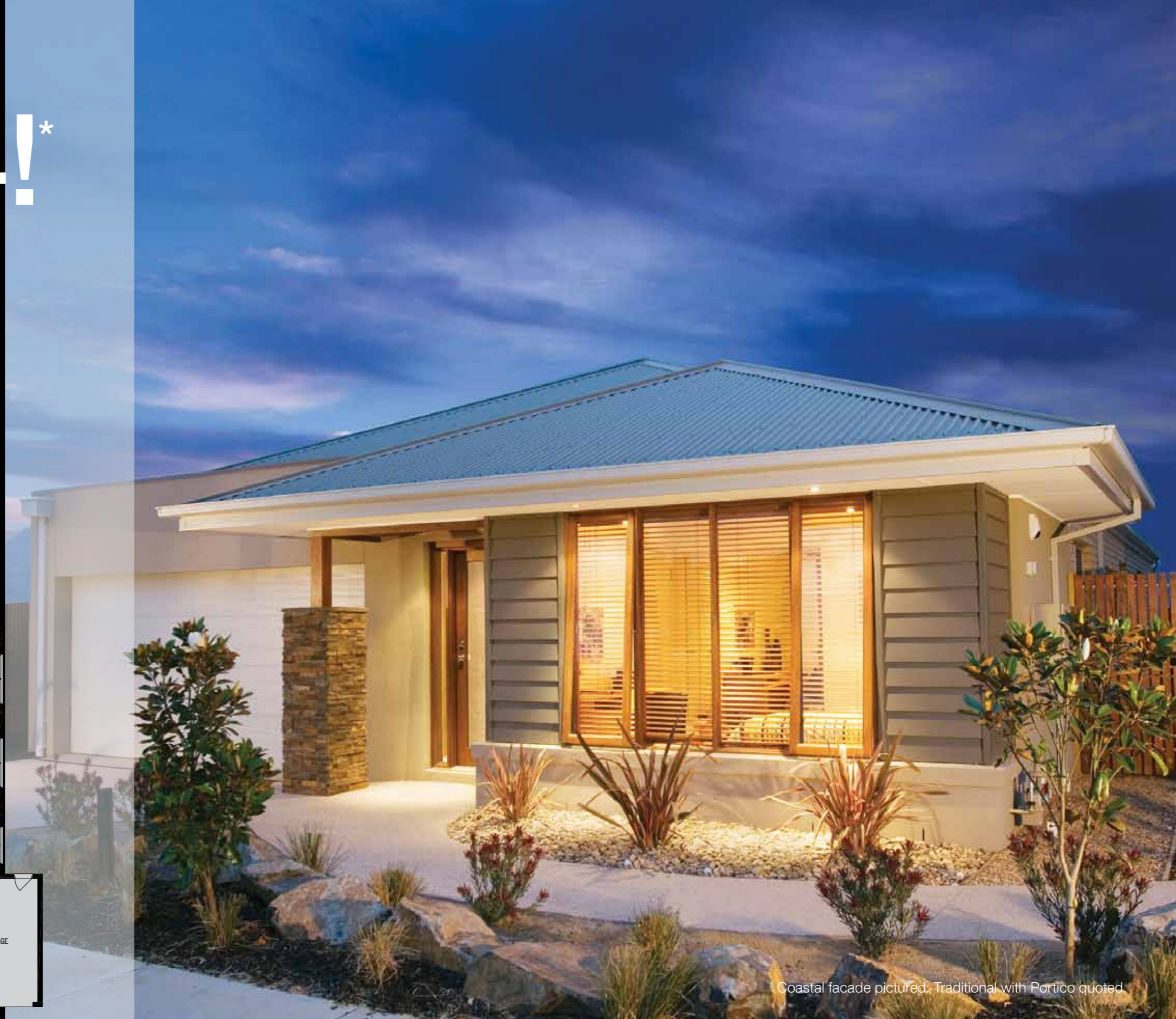
Coastal facade pictured. Traditional with Portico quoted.