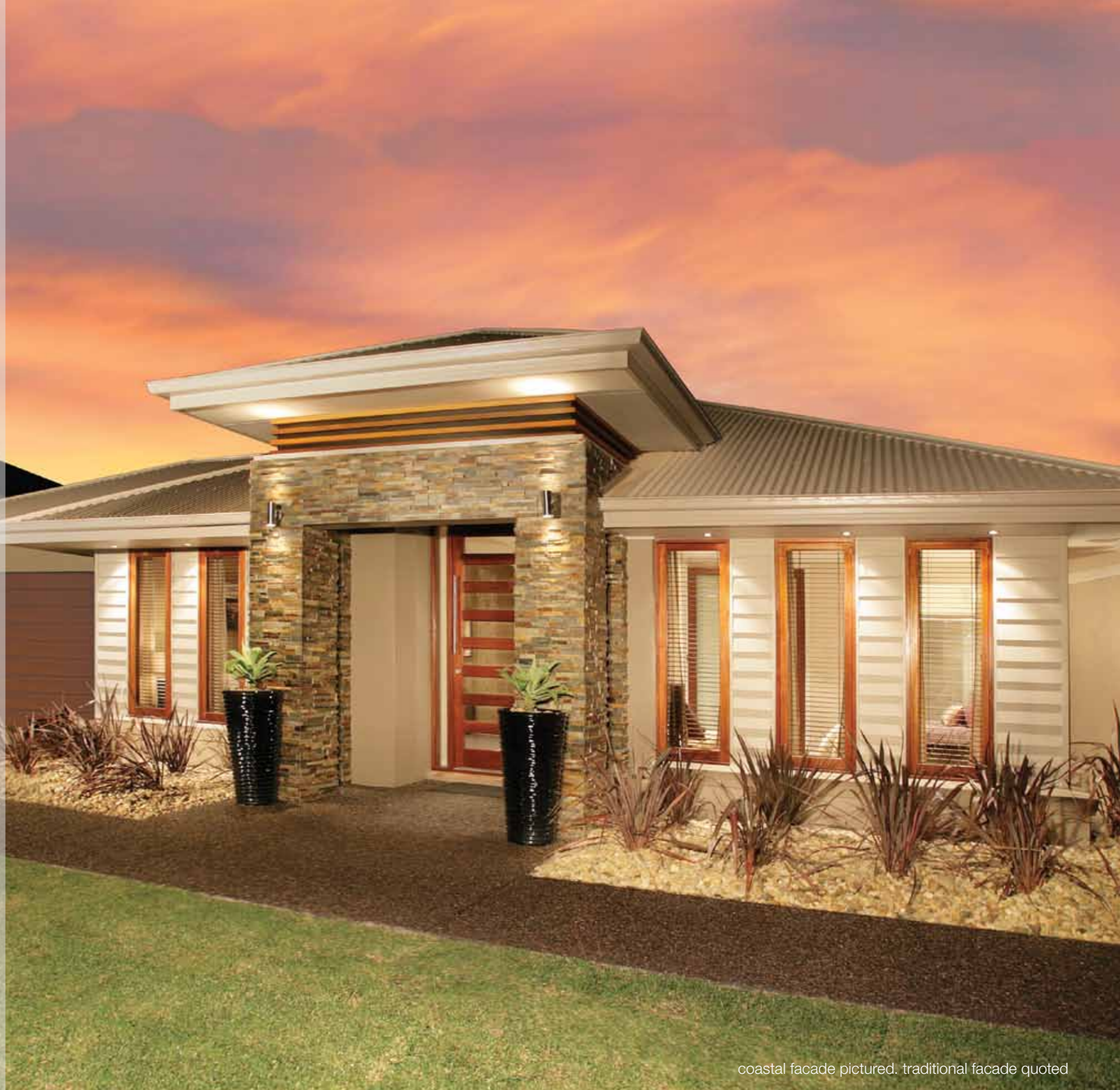
coastal facade pictured. traditional facade quoted